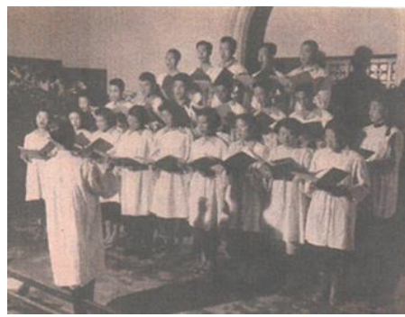
Our Taipei Church choir (I'm at the right of the middle row)