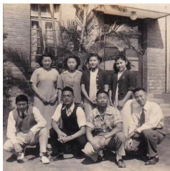
The President and Mme Chiang's choir (I'm top row, second from left)